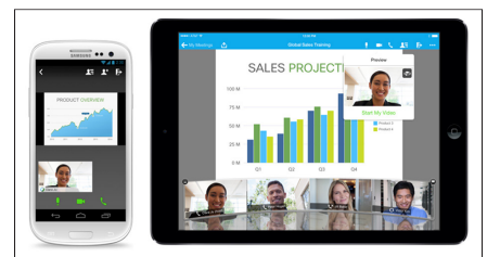
Figure 3. Meet from Any Device

Enjoy a rich meeting experience with audio, video, and content sharing across Android, iPhone and iPad, BlackBerry 10, and Windows Phone 8 devices.