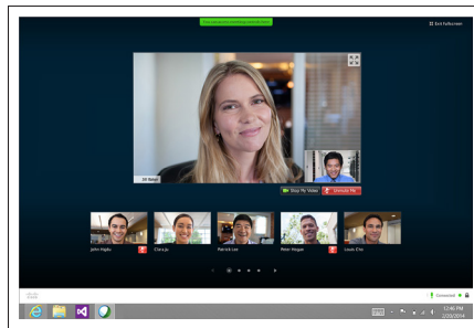
Figure 2. View of Full-Screen Mode

Make it even easier for others to join you in your Personal Room through the WebEx Video Bridge. People can join your video conference through any standards based video system.